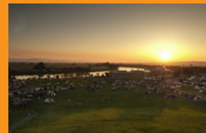
Sunset at Shinotsu Park Camping Ground

○ Auberge Mashike → (around 1km) → ○ Mashike Station (out and back) → (around 42km) → Kawashimo, Hamamasu District - Lunch → (around 73km, via Lake Fukuro) → Michi-no-Eki Shinshinotsu