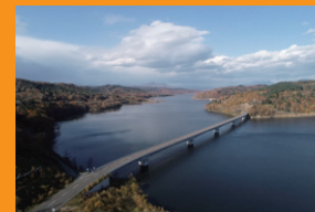
Lake Tobetsu Fukuro

Day 3: Forest, countryside and town area (approx. 120km) Iwao Onsen Hotel Sekiyoso (Approx. 10km) - Seicomart, Hamamasu (lunch) - Lake Tobetsu Fukuro/Bokyo Bridge/Komatsu no Sawa Bridge (approx. 110km with rest areas en route) - Michi-no-Eki Tobetsu